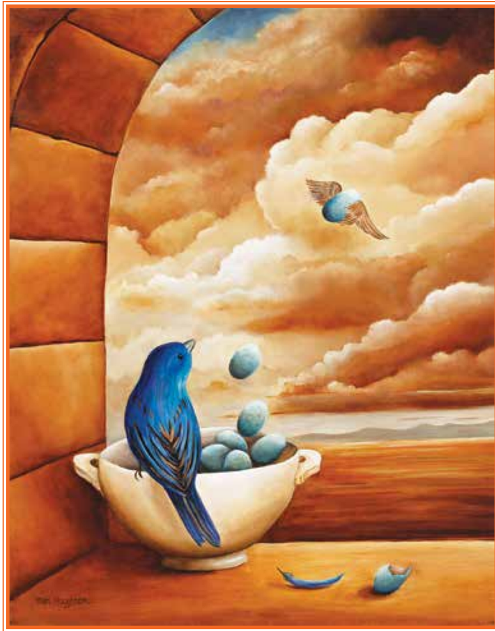
Green Children, P. 72